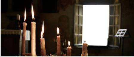
“Secret of the Fire” by CM Healy

Two eyes lock across the room, Their hearts begin to yearn. They soon elope and strike a match A wedding candle burns.